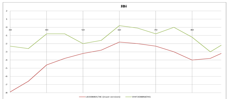
Gain curves showing improved gain compared to a standard Comrod VHF mast mounted antenna (LB3088SF)