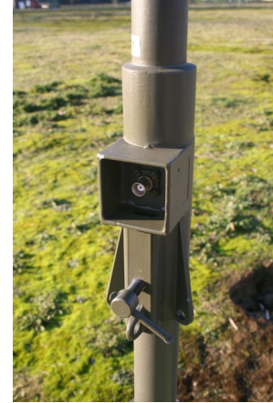
Mast mounting base with BNC female connector