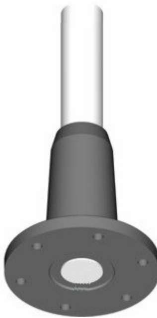
AT53DS16-2 Deck mount, self supporting.