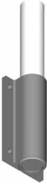
AT53M16-2 Mast mount, self supporting.