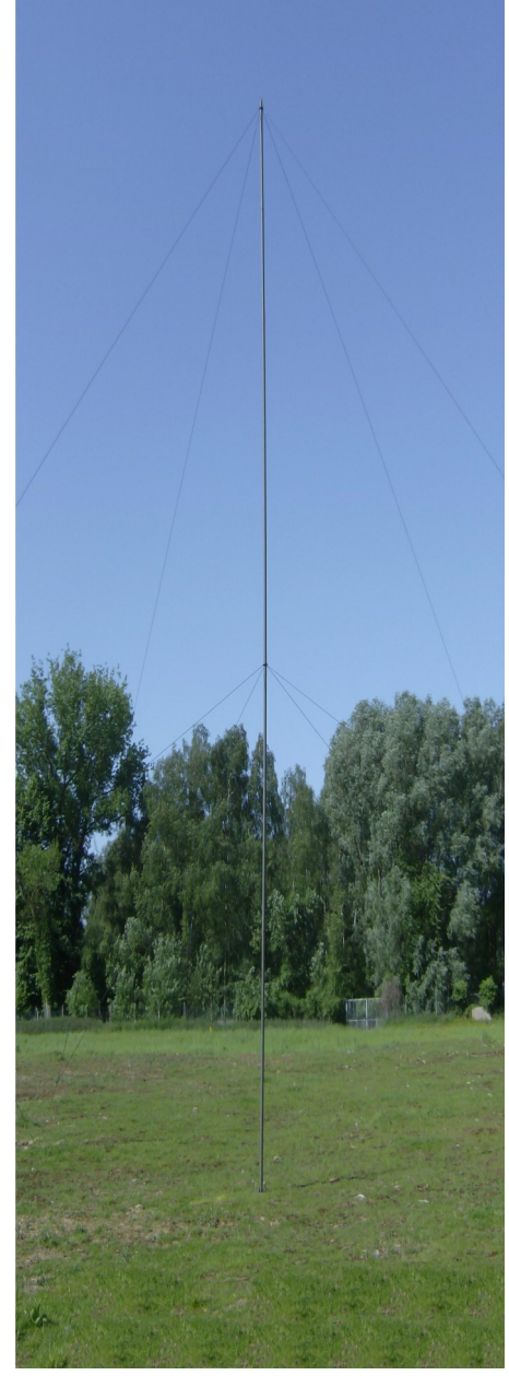
AMX54 mast with AMX54 mast extension kit 9 metre mast with 4-way 2-lane guying

* Subject to top load wind surface area.