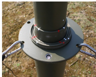
Bayonet tube locking system