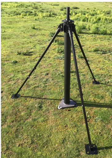
Tripod assembly (option)

* Typical values shown. Actual values will be subject to a combination of top load weight, top load area and pointing accuracy required.