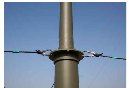
GRP composite tube sections