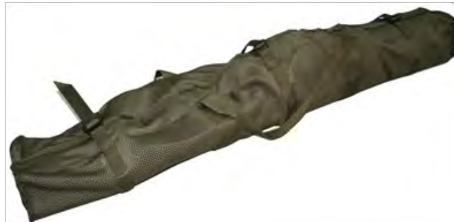
Mast packs down into a single, easily transportable bag