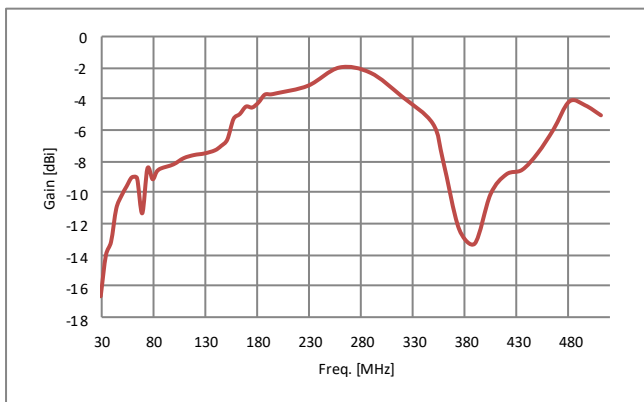
Typical gain curve mounted in centre of a 1.2m x 1.2m ground plane