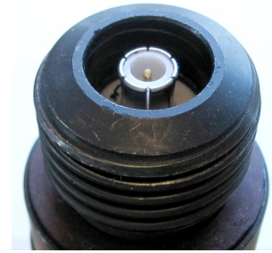
CEF connection (top of the base)