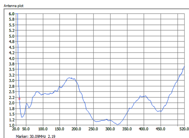
Typical VSWR, mounted on corner of 3 x 3m ground plane